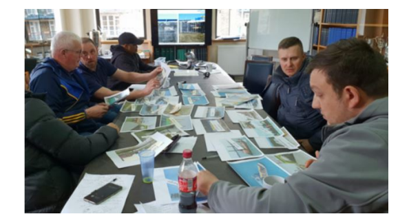
Barge Loading Course

This one-day course provides an overview and knowledge of safely securing vessels to a quay, including line-person duties, safe access, and communications.